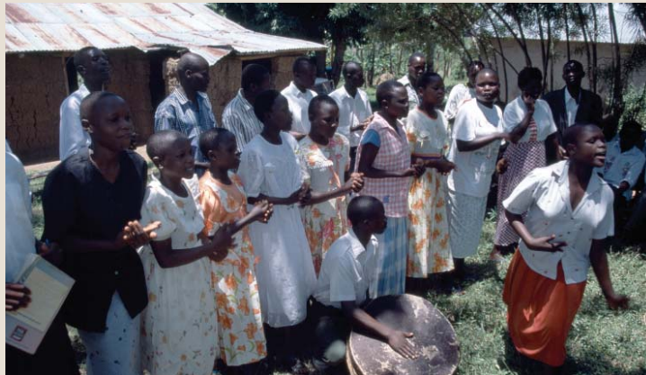
Nalyaka’s youth group raises awareness of HIV through drama, dance and song

In sub-Saharan Africa 25 million people are living with HIV, half a million of them in Uganda. HIV is reversing the benefits of decades of development work. Tackling HIV is a global priority and in Uganda ACET is on the frontline.